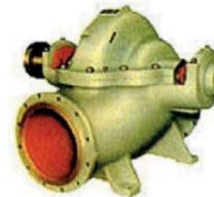
Horizontal & Vertical MP Fire Pumps FM Compliant