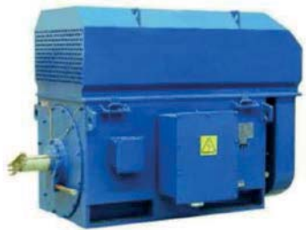
YKK Upto 12000HP Compressor / Marine Duty Motors All Voltages / Cycles / Frames

COMPLETE REVERSE ENGINEERING FOR ALL PUMPS & PARTS / OVER 50 YEARS OF SUPPLYING PRICE COMPETITIVE PUMPS AND PARTS / OVER 70,000 DRAWINGS AND PATTERNS USED TO MANUFACTURE PARTS / ALL METALLURGY & LINER ELASTOMERS AVAILABLE / INVESTMENT CAST-HIGH VOLUME PARTS.