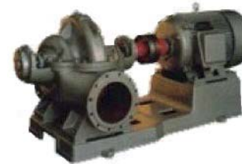
Horizontal Split Case All Sizes & Metallurgy (API-610 & ANSI)