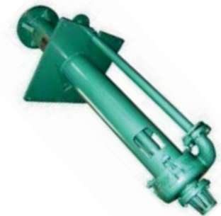
Vertical MP Cantilever Slurry Sumps Hard Metal & Rubber Lined