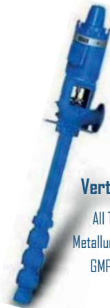
Vertical Turbine All Types, sizes & Metallurgy Hasta 65,000 GMP @ 3,500 TDH