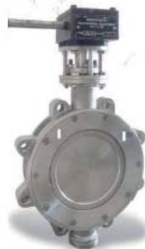
High Performance HP MP Butterfly Valves Double Offset and Many Others. API / ANSI