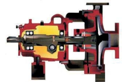
ANSI-Chemical Process Pumps All Sizes 3G & Metallurgy