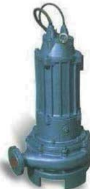
Sumersible MP Slurry Sumps Hard Metal & Rubber Lined Mine Dewatering / Tailing Trash